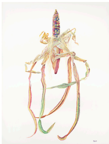
11. Cintli, Corn, Maíz 2020 Jessy DeSantis Acrylic on canvas Museum purchase, 2023