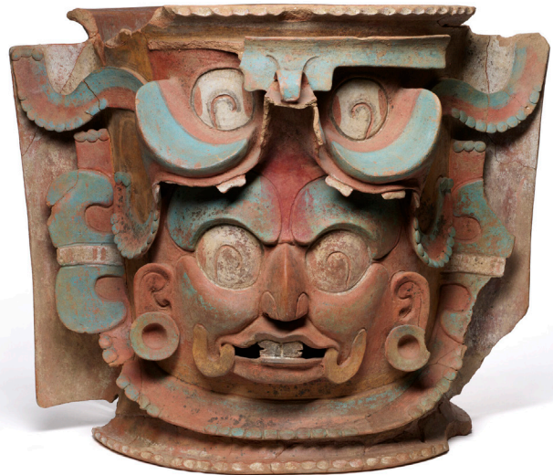
2. Burial Urn 600–850 CE Artist: K'iché (Maya) Earthenware, post-fire paint Gift of John Bourne, 2009