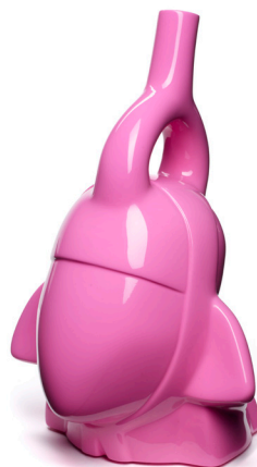
14. Neo-Huaco Resin 2023 Ana de Orbegoso Resin Museum purchase, 2024