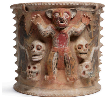
13. Polychrome Figural Urn with Jaguars and Skulls 600–900 CE Artist: Maya Earthenware, paint Anonymous gift, 2009