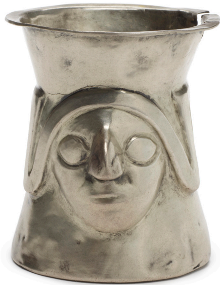
1. Drinking Vessel ("Aquilla") 900–1100 Artist: Lambayeque (Sicán) Silver alloy Acquired by Henry Walters