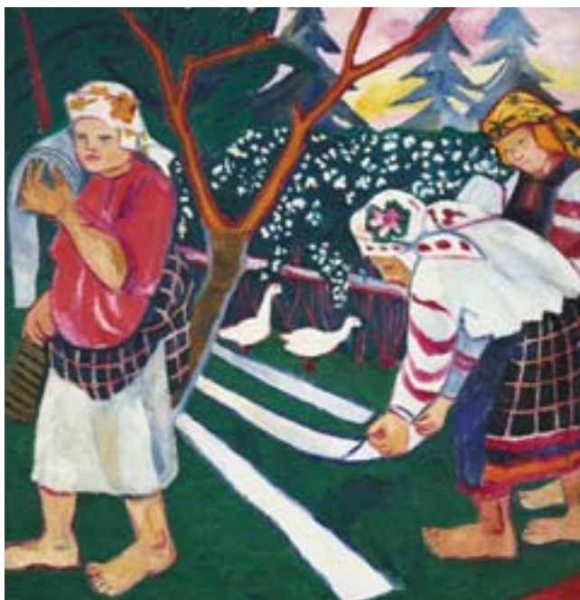
Top: Firm of Carl Fabergé, Striding Elephant , bottom: Natalia Goncharova, Bleeding Linen , 1908, oil on canvas, The State Russian Museum, St. Petersburg